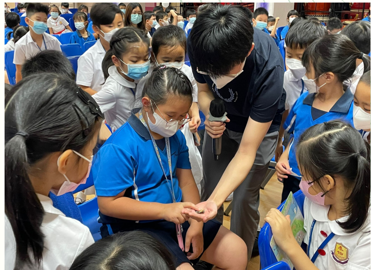
▲ Students are touching the specimens of insects.